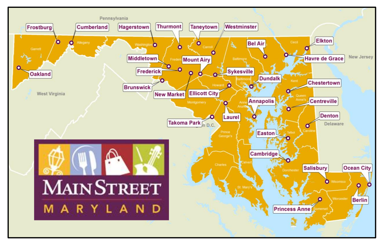
Since 1998, the Maryland Department of Housing and Community Development's Main Street Maryland program has been instrumental in fostering economic development in the State's core communities, preserving local historic and cultural resources while supporting small businesses and promoting new investment and business development.